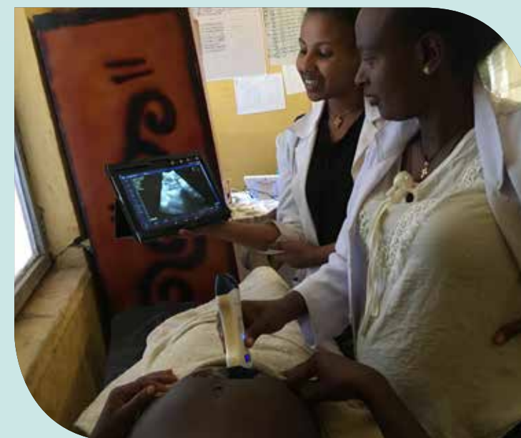
Ethiopian midwives pilot portable ultrasound device

In all three countries in 2019, Born on Time supported community healthcare workers to reach 143,897 women, adolescent girls and newborns through household visits. These intimate, individual appointments are critical in the health of pregnant women and adolescent girls, new moms and babies as they cover issues like the danger signs of premature labour, how to reach health facilities for a safe delivery, breastfeeding support and family planning.