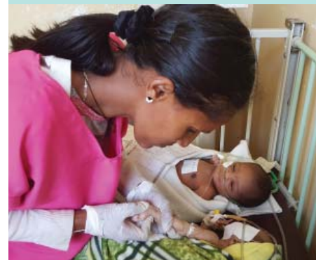
A NICU trainee demonstrates affective attachment techniques at Felege Hiwot Hospital in Ethiopia