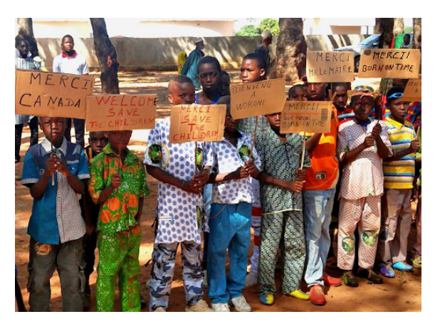
Children in Mali thanking Born on Time for their work

This quarter, Born on Time Mali conducted 1,414 awareness sessions on Lifestyle, Infection, Nutrition and Contraception (LINC) factors, which are risks that can lead to preterm birth. These awareness sessions also discussed gender equality components. All Community Health Workers (CHWs) who completed the training of their community associations and organizations started awareness-raising sessions, which reached 33,482 individuals including 26,471 females and 7,011 males.