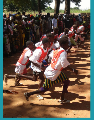
Children starting the co-ed race

International Day of the Girl-On October 28th, as the world celebrated the International Day of the Girl, Born on Time joined the celebration in Kadiolo, Mali. This event included welcome speeches from the community leaders, BoT staff and local and municipal authorities, as well as traditional music and dancing, rousing speeches on Gender Equality from young women, a co-ed foot race (where all top three winners were girls), a blood donation drive, and a BoT Question & Answer period.