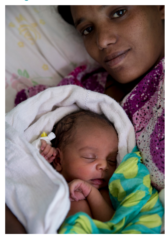
Mother in Ethiopia with her new baby

As we unpack our goals for the year ahead, our commitment to learning and course-correction underpins the importance of our mid-term review, currently being rolled out across all three countries.